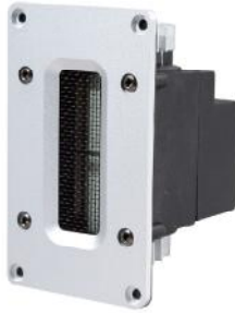
NeoX2.0 ribbon tweeter