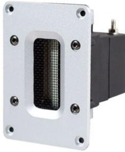
NeoX1.0 ribbon tweeter