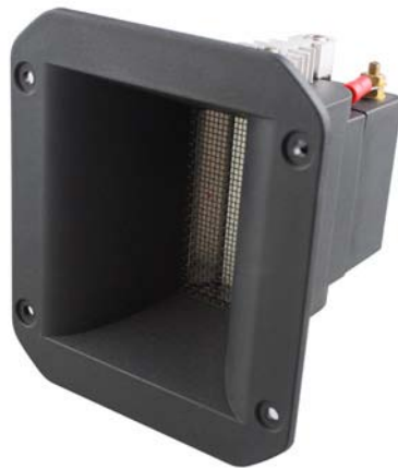
NeoCD3.5H True Ribbon Tweeter